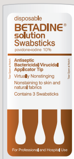
Betadine ® Solution Swabstick 3s