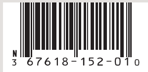
Betadine ® Solution Swab Aid ® Pads